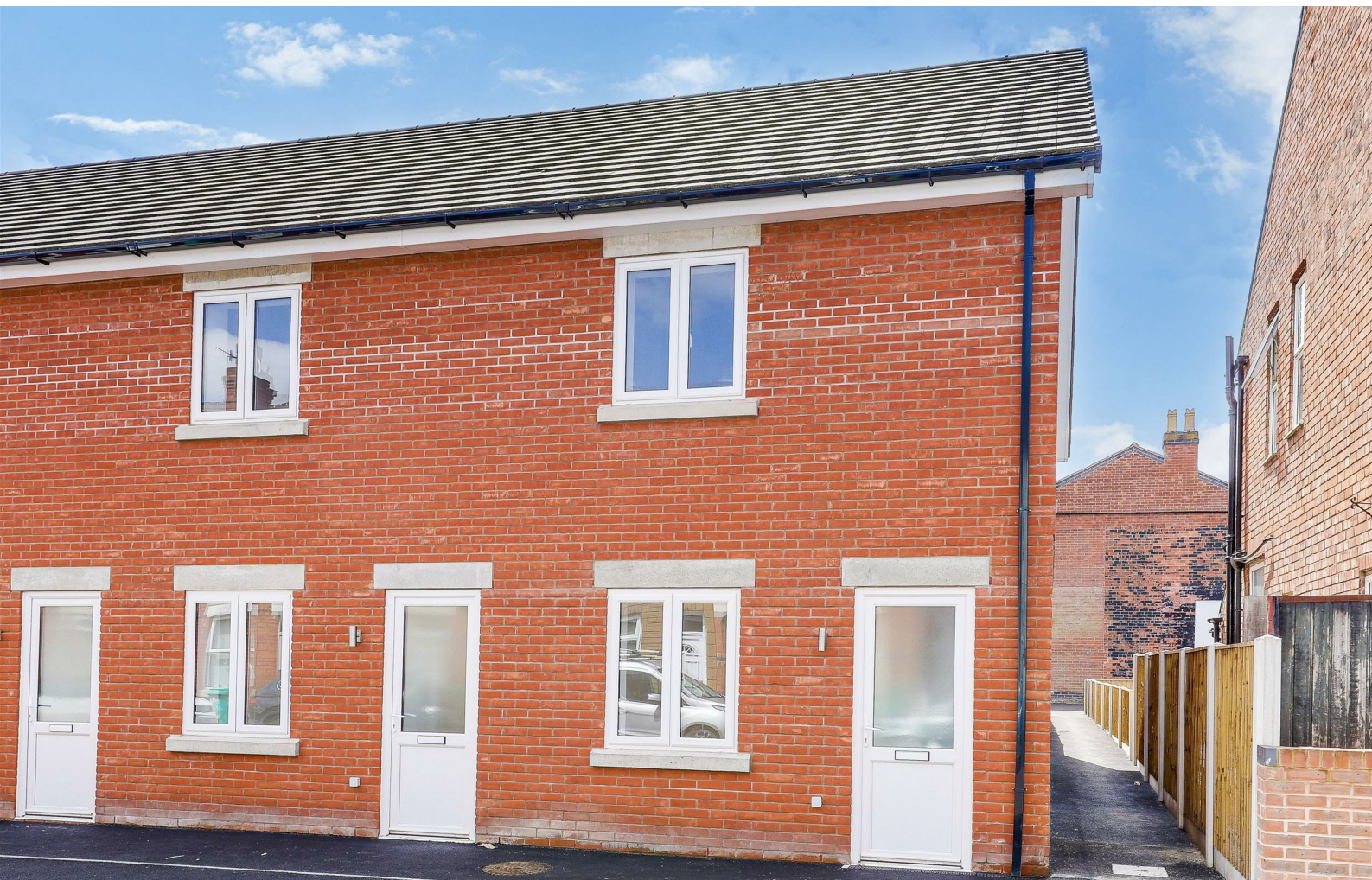
Merchant Street, Bulwell, Nottinghamshire NG6 8GT